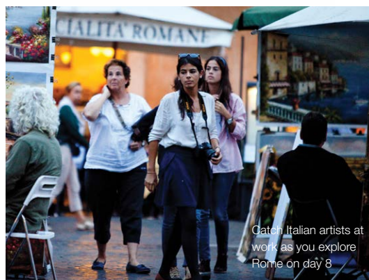
Catch Italian artists at work as you explore Rome on day 8