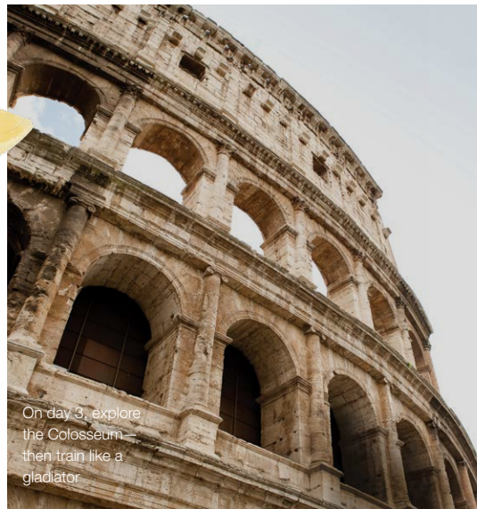
On day 3, explore the Colosseum—then train like a gladiator