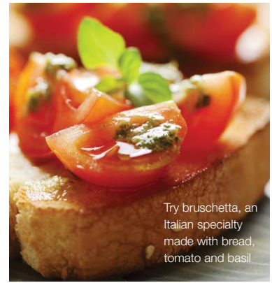
Try bruschetta, an Italian specialty made with bread, tomato and basil

We believe in experiential learning at the most important sites. Your Program Director is with you at every step, providing their own perspective and local tips.