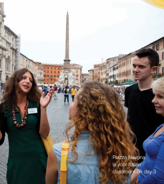
Piazza Navona is your Italian classroom on day 3