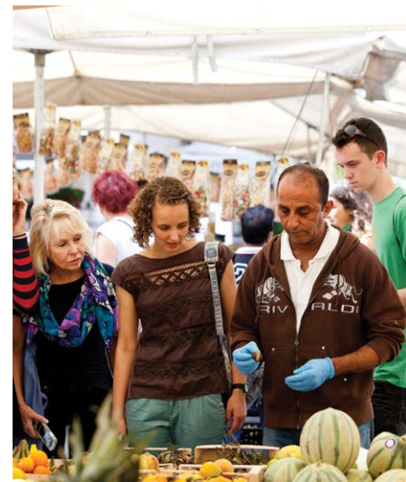
^ Interact with vendors at a Rome's Campo de Fiori market on day 5