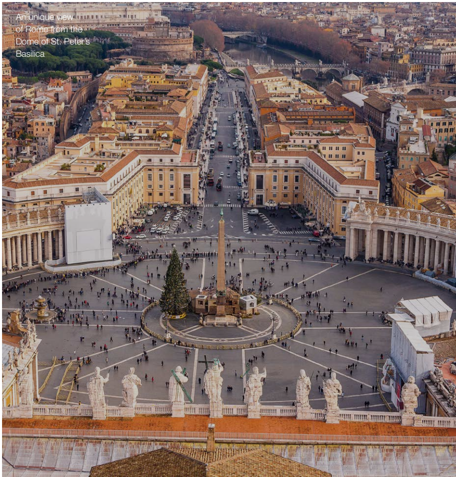
An unique view of Rome from the Dome of St. Peter's Basilica