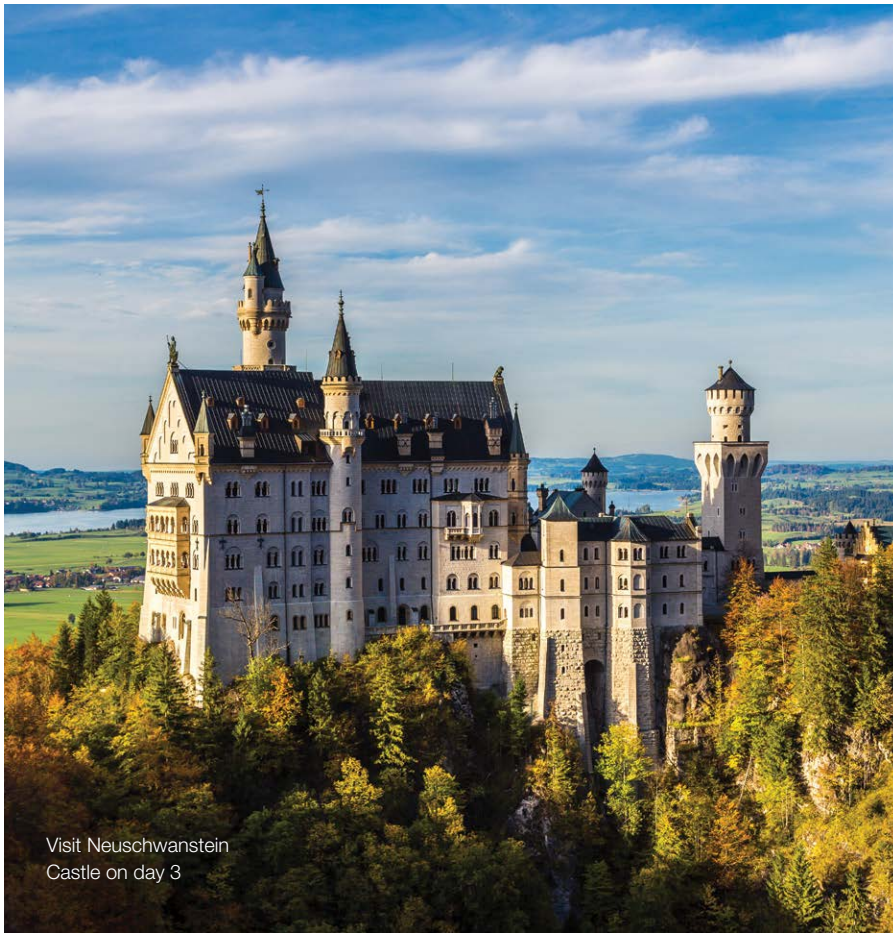
Visit Neuschwanstein Castle on day 3