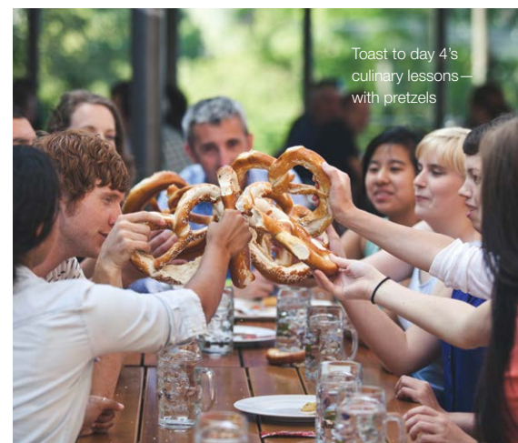
Toast to day 4's culinary lessons— with pretzels