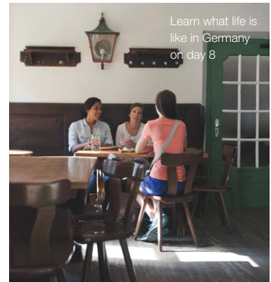
Learn what life is like in Germany on day 8

We believe in experiential learning at the most important sites. Your Program Director is with you at every step, providing their own perspective and local tips.